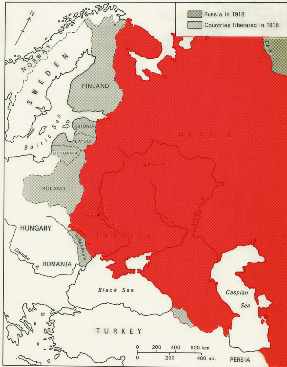
Russia in 1914