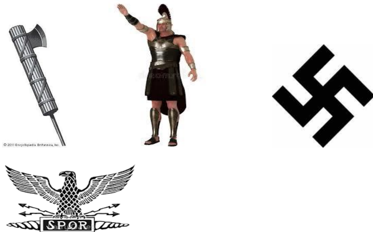
Figure 2.1 Illustrates (from left to right): fasces, the Roman salute, swastika and Roman eagle. ( under the eagle there is the acronym: SPQR, or Senatus Populusque Romanum (the Senate of the peoples of Rome)

In our far too confused and manipulated world, there are a series of political organizations, parties, and individuals who still have sympathy for the socialist and communists. Do these people know about the atrocities against millions of people who have perished just because they did not accept to live in a socialist/communist system? There are members of the media, leftist professors, and politicians who drastically accuse the Nazis of the atrocities of 1933-1945 but very conveniently suffer amnesia when fingers are pointed to the socialists and communists of Russia and the world.