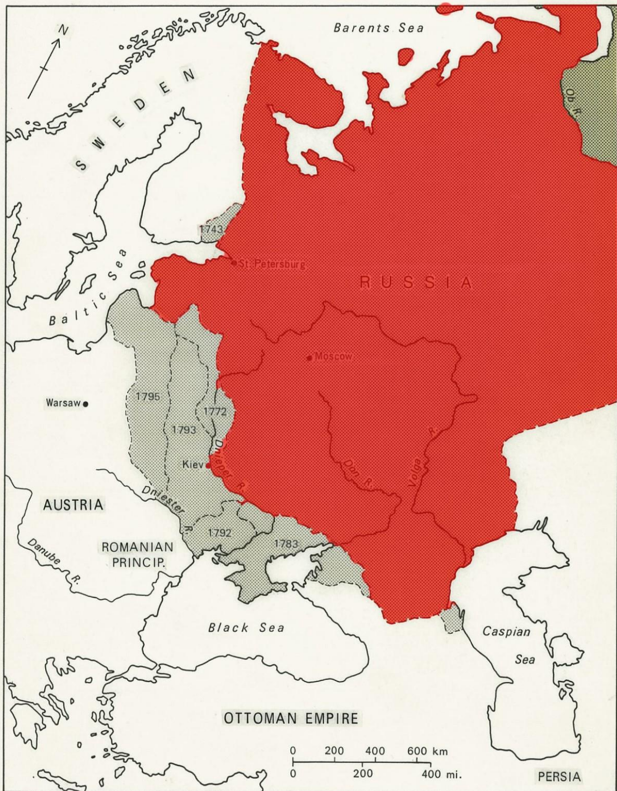
The Acquisitions of Catherine the Great, 1762-1796