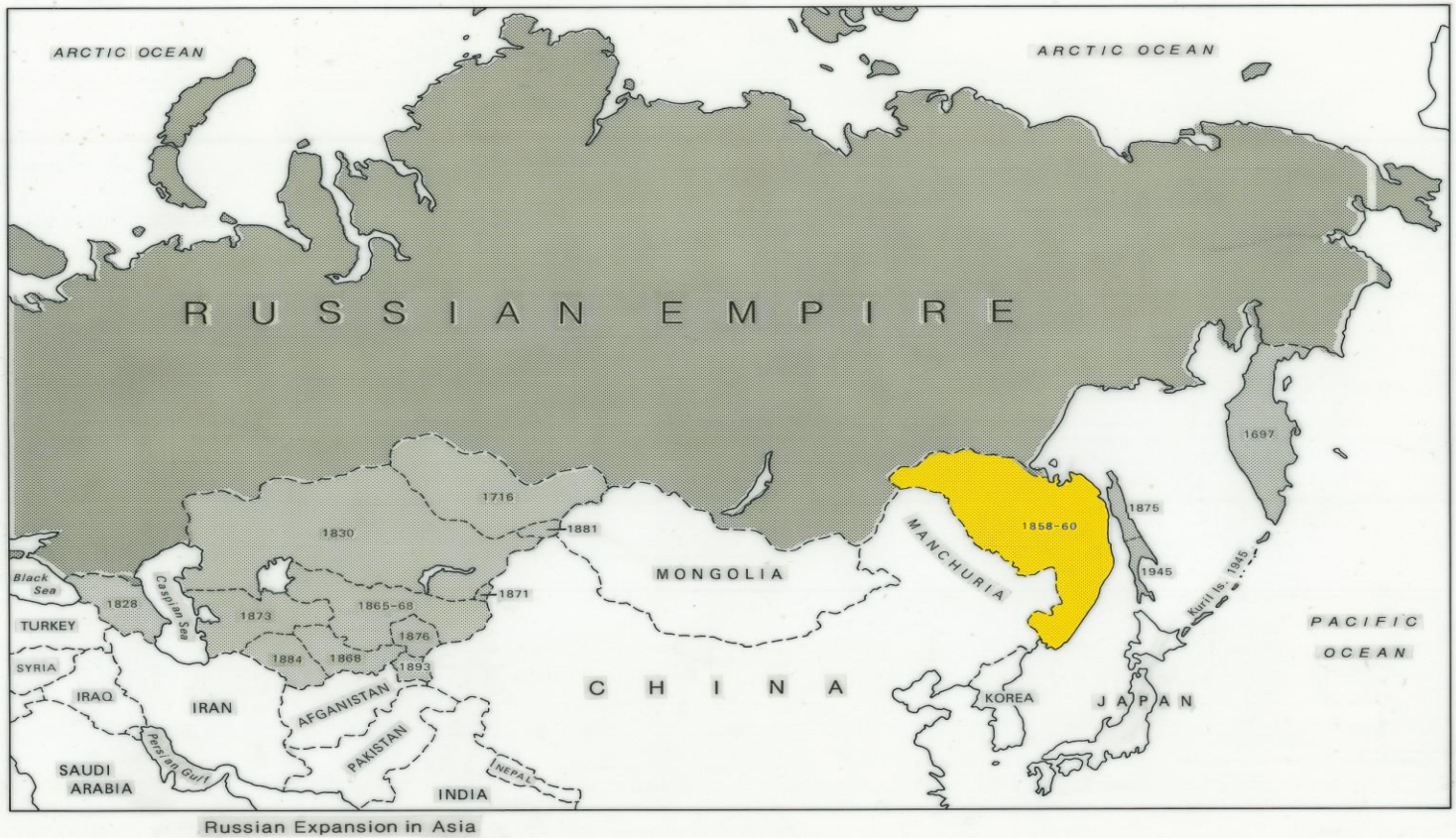
Russian expansion in Asia, including the province of Manchuria (in yellow) from China