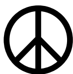
Figure 4.1. British artist Gerald Holtom has created the nuclear disarmament symbol and displayed in most anti-US/Western demonstration. Same symbol has never be used against Russia!